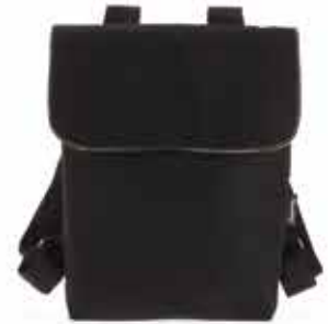
Backpack | PR12