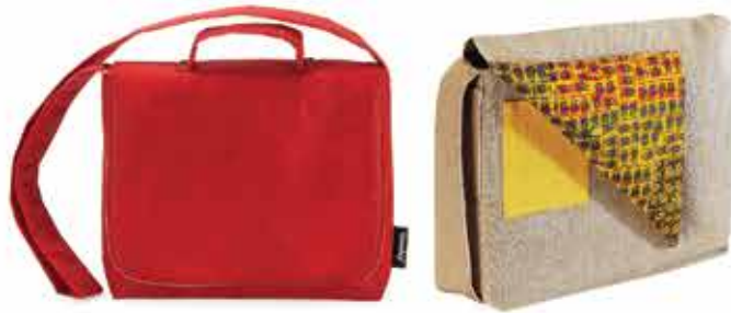
Horizontal Congress Bag | PR09