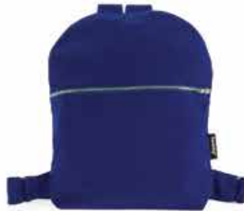
Rounded Backpack | PR11