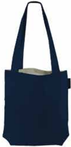
Business Bag | PR02