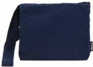
Laptop Bag | PR10