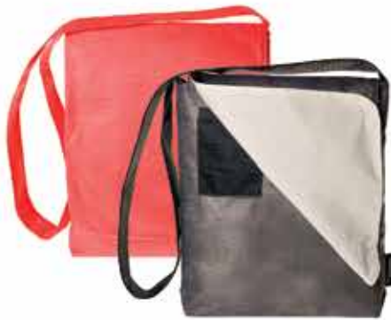
Vertical Congress Bag | GR08