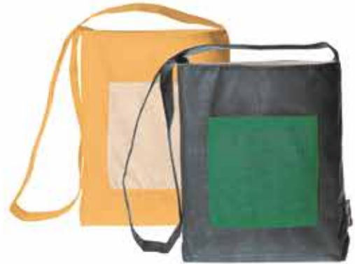
Shoulder Bag | GR07