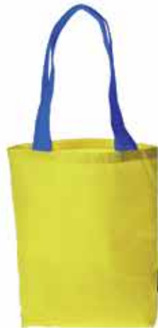
Business Bag | GR02