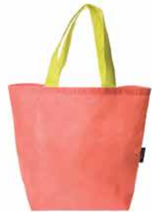
Shopping Bag | GR03