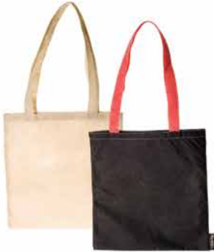
Basic Bag | GR01